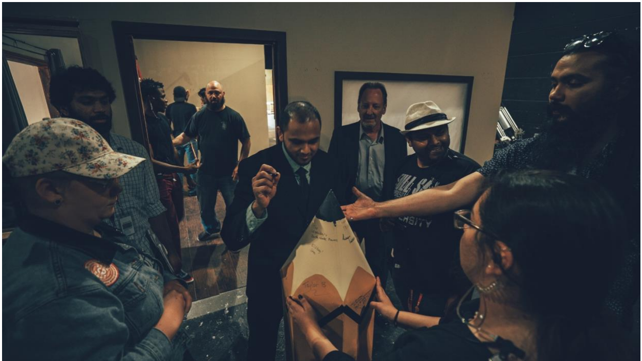
The cast and crew sign the Giant Pencil

For the entire collection of BTS and publicity stills: