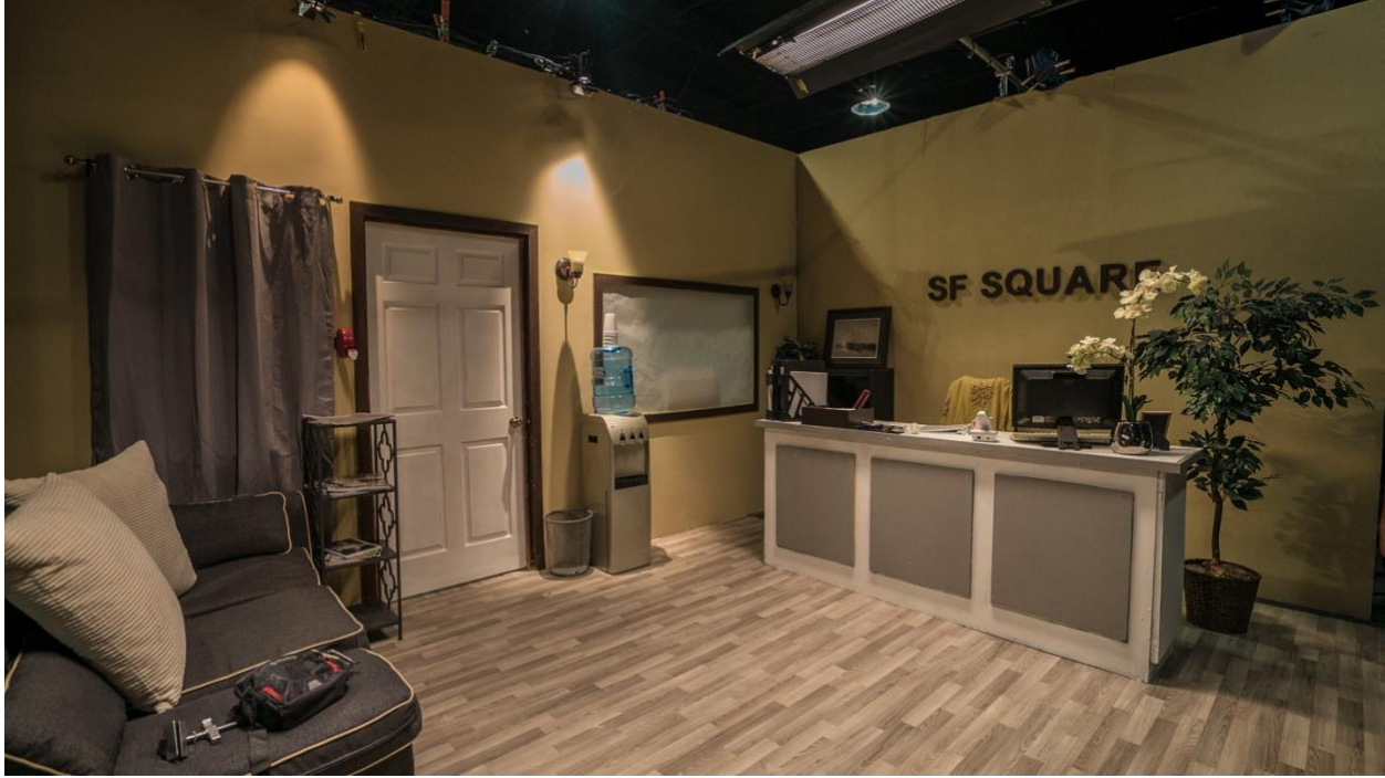
The lobby and waiting area