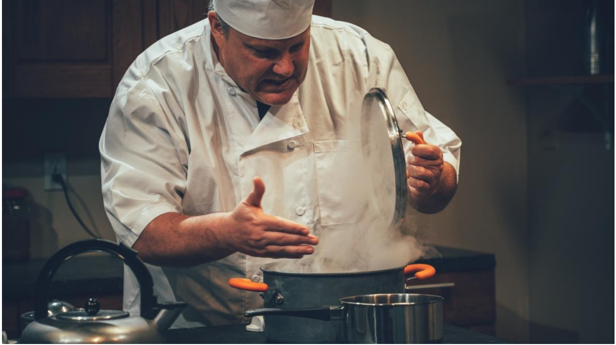
The Chef is cooking the books.