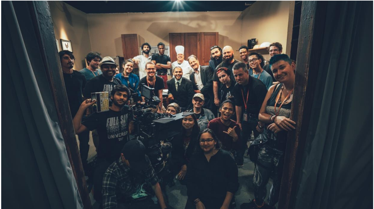
Part of our cast and crew on wrap day!