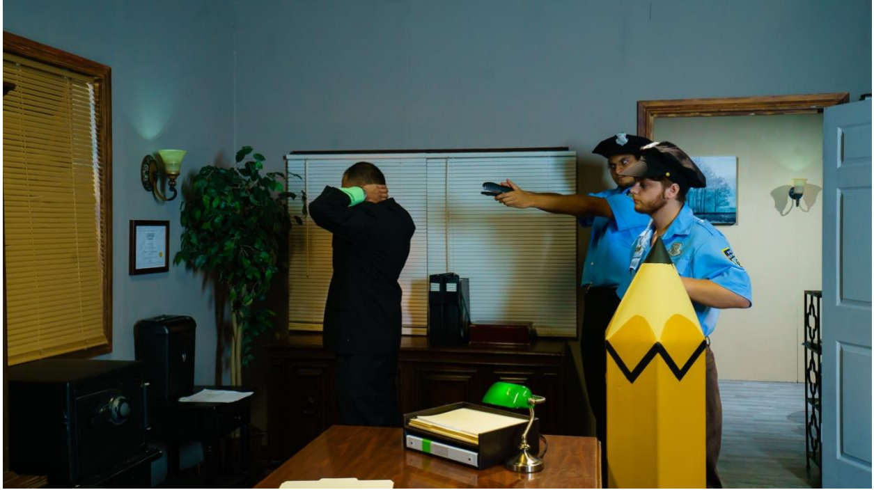
Conrad is arrested by the IRS in an undercover sting.